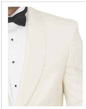
Shawl Collar White