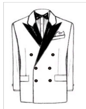
FDB8 6 Button - Peak Lapels Satin Faced