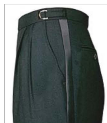
FTR3 Waist-Adjuster Option