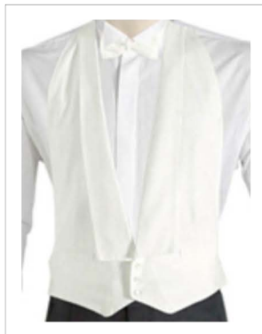
M-WC-41 Marcella Collar