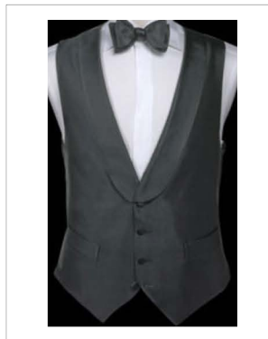
M-WC-35 Shawl Collar