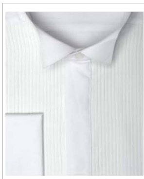
FSH1 Wing Collar-Hidden Butt. Ribbed Full Front