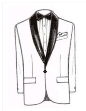
FSB3 1 Button - Shawl Collar Satin Faced