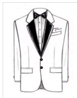
FSB4 2 Button - Notch Lapels Satin Faced