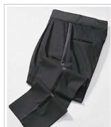
FTR1 Standard Pleated