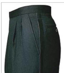
FTR1 1/4 Slanted Pockets Standard