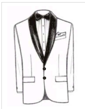
FSB6 2 Button - Shawl Collar Satin Faced