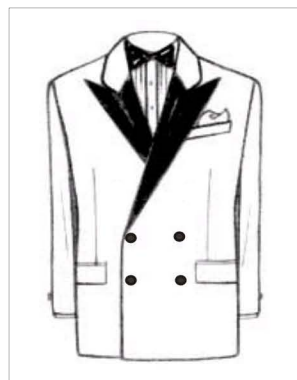
FDB7 4 Button - Peak Lapels Satin Faced