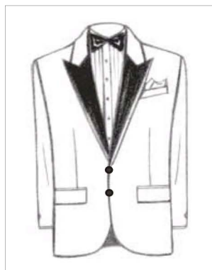
FSB5 2 Button - Peak Lapels Satin Faced