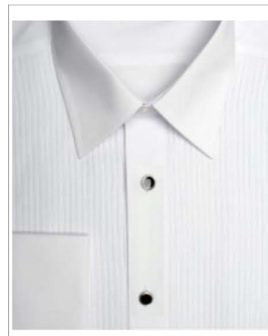
FSH4 Reg. Collar-Studs Ribbed Full Front