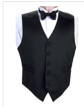
M-WC-37 5 Button Standard