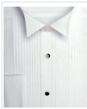
FSH3 Wing Collar-Studs 1/4" Pleated-1/2 Front