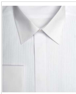
FSH2 Reg. Collar-Hidden Butt. Ribbed Full Front