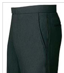
FTR2 Flat Front Option