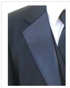
Notch lapels Satin Faced