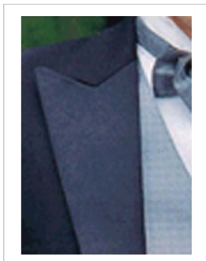
Peak lapels Blue Satin Faced